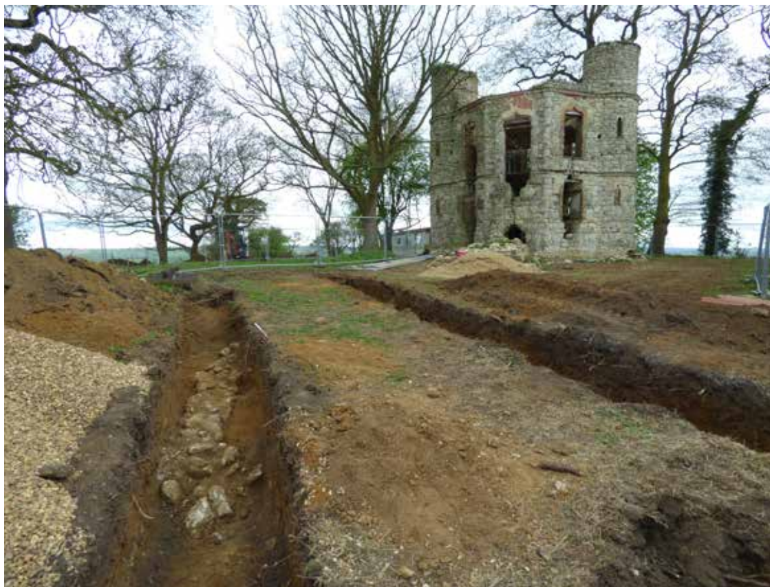
FIGURE 2 The site at Dinton during excavation work, looking north-west

A programme of archaeological observation, investigation and recording was carried out by MOLA at Dinton Castle between March and April 2017. The works, which observed service runs and ground interventions on the site (Fig. 2), formed part of an approved planning application for restoration and refurbishment of the 18 th -century folly as a residential dwelling. An Anglo-Saxon inhumation cemetery was excavated adjacent to the site in 1994 (Hunn, Lawson & Farley 1994). Archaeological features identified during the current works included a limestone wall, two small gullies, four