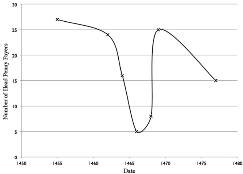
FIGURE 2 The population of Ashley Green during the Wars of the Roses

The rental also reveals features of the town, usually by locating a field or a house in relation to it. There was, for example, 'a cross in the middle of the town', another cross referred to as 'Higham cross', 'the stone bridge' (presumably the only one), a 'cottage called a Gatehouse', Amy Mill, and Pillory Green. The roads and lanes mentioned included 'a section of the King's Highway leading from Chesham to Tring' (only one highway could squeeze through the valley at Chesham and in contemporary documents it was referred to in other ways, including 'the road leading from Wycombe to Berkhamsted'), as well as Amy Mill Lane and 'Well Lane leading from the vicarage of Chesham Leicester toward Chesham'. An entry that mentioned 'a field called Bury Hill containing 40 acres next the churchyard' indicates that there