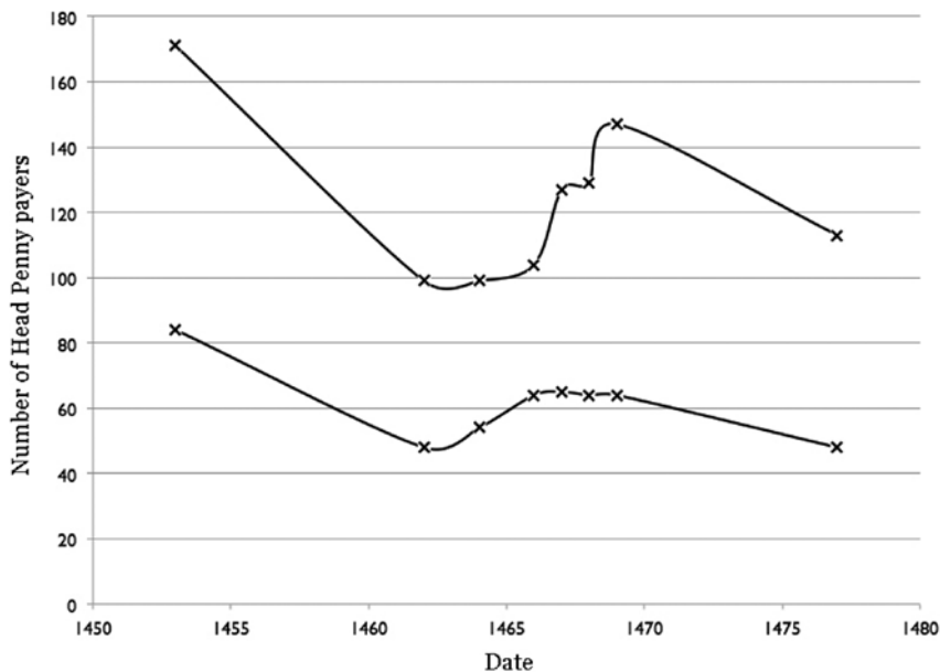
FIGURE 1 The population of Chesham during the Wars of the Roses

Turning to the town, the lands there on which tithes were due were in Church Field, Bury Field and Dungrove Field, as well as more specifically in 'Several in Churchfield' and in 'Several by Aldeworth'. Both Dungrove and Severals can be found on the Tithe Map, and are situated above and to the east of the valley occupied by the town. A farm called Dungrove Farm still stands above the valley today, and the pattern of the strips into which the land used to be divided can still be detected in some of its meadows. Severals is covered by a housing estate. Neither Bury Field nor Church Field appear on the Tithe Map. Both Several and Church Field, however, are mentioned in the rental for Chesham Bury dated April, 1535. The reference to the former states that John Turnour 'also holds one piece of land in Dungrove Field next the Several style', from which we can deduce that Several was adjacent to Dungrove Field with nothing (not even Church Field) in between. The references to Church Field include the following: