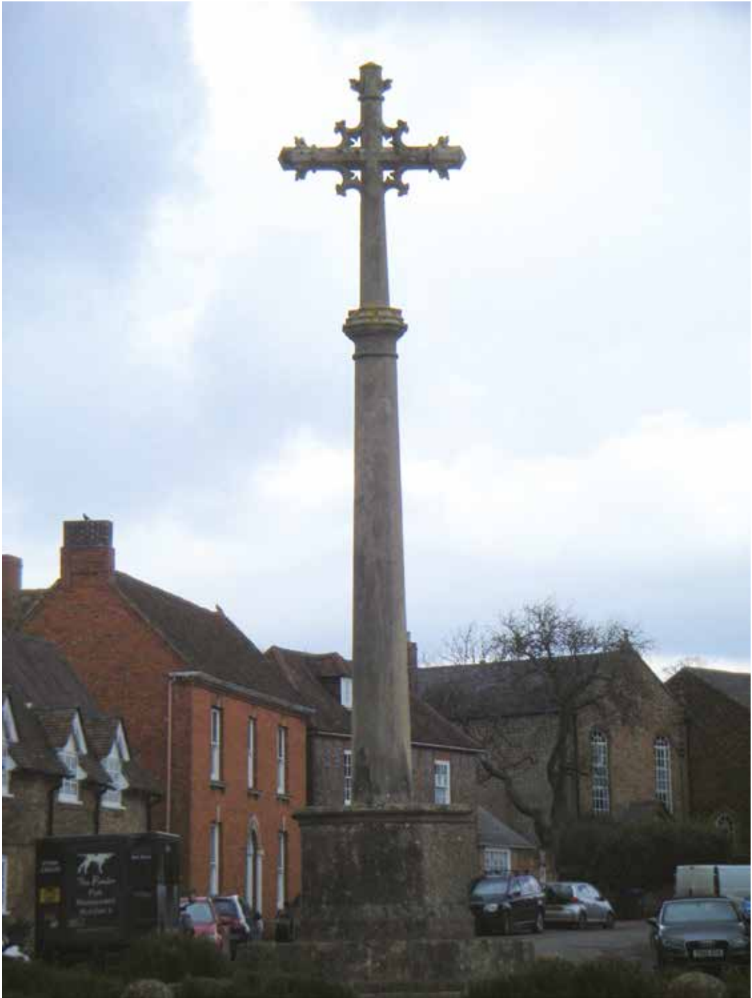
FIGURE 5 The market cross at Brill