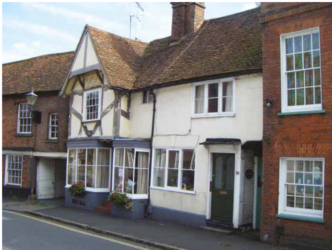
FIGURE 4. The fourteenth century house in Church Street

Although more sheep than before were being grazed soon after the Black Death, it took some time for this to become explicitly apparent in the court records. The first mention of a personal possession with any connection to sheep was the listing of a sheepskin ( j pellis cum lanitia ) among the belongings of Richard Carter, who died in 1368 (in the court record with CBS reference D-BASM/18/62). It was not until 1382 (in the court record with CBS reference D-BASM/18/83) that anything as mundane as a pair of shears ( j par forpices ), for example, was recorded among the possessions of the deceased husband of Christine Gromet. Since all his other possessions were tools, such as a threshing rake and an iron fork, sheep-shearing had been just one of his seasonal activities, which shows that some degree of organization was in place by the time the second wave of sheep farmers appeared on the scene.