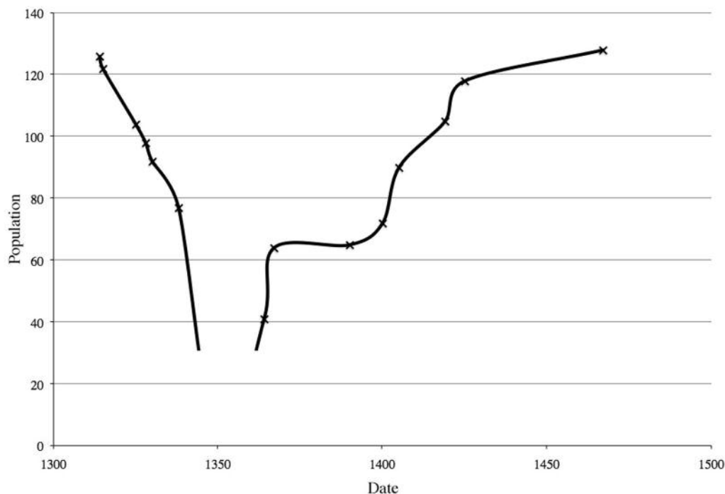
FIGURE 1 Graph showing the population decline before the Black Death and the recovery after it

In the circumstances, it is not surprising to find