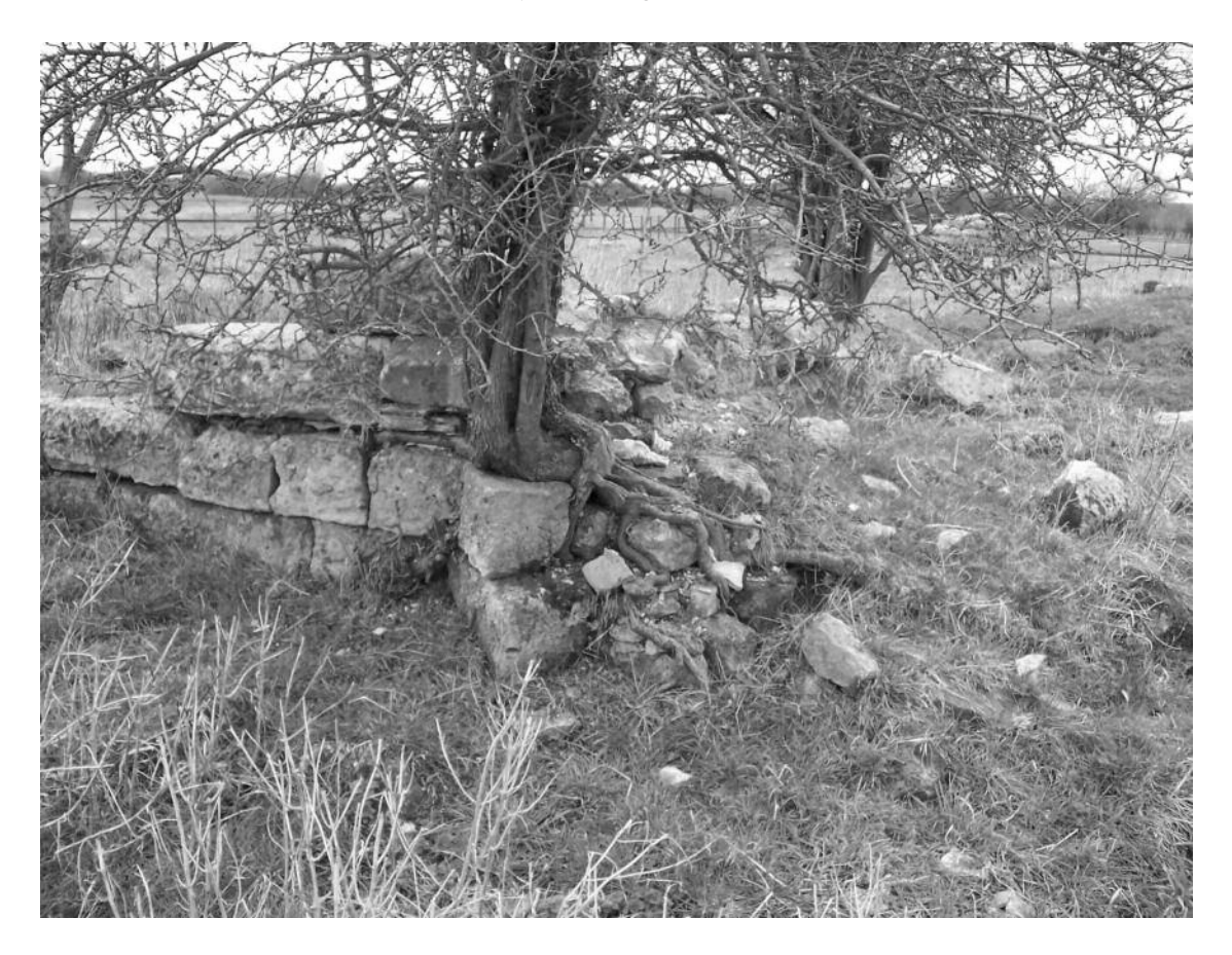
PLATE St Peter's Church, Quarrendon: ruins at risk from tree roots (the bush has since been removed as part of the conservation work)

hamshire has been to inspire a popular book and museum exhibition timetabled for spring 2010.