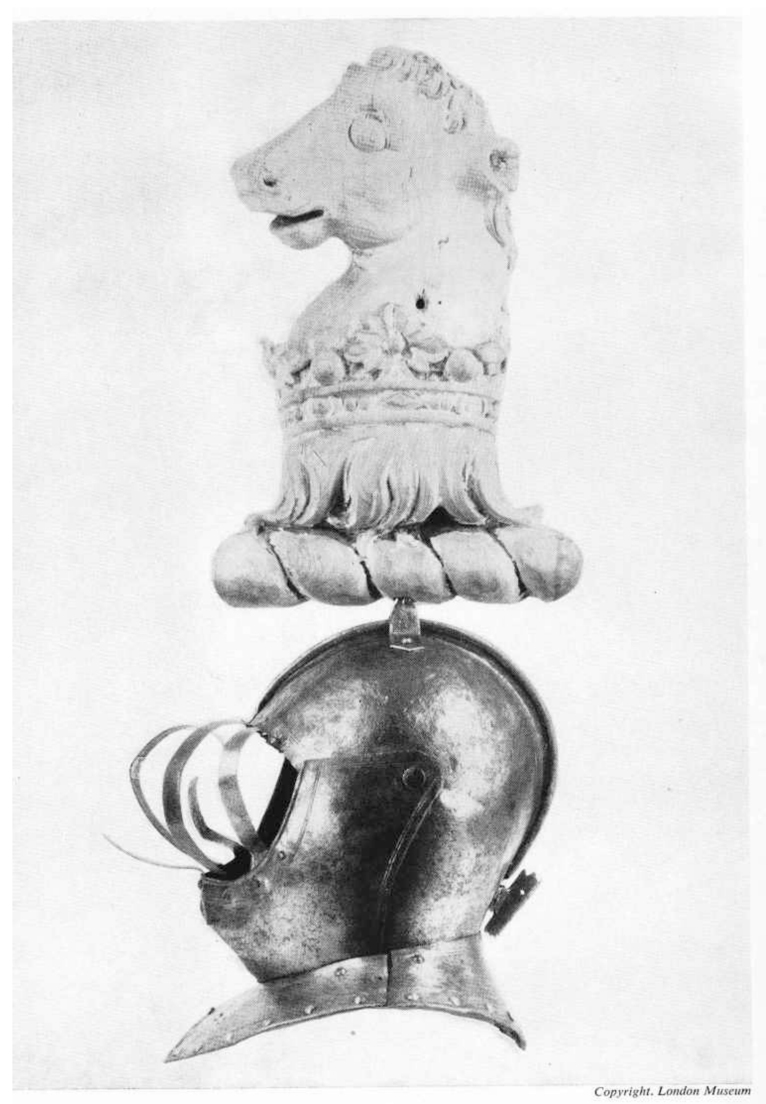
PLATE XIV. The helmet after treatment, and with its crest restored.