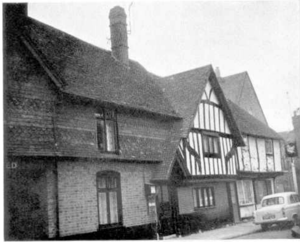
PLATE V (a).