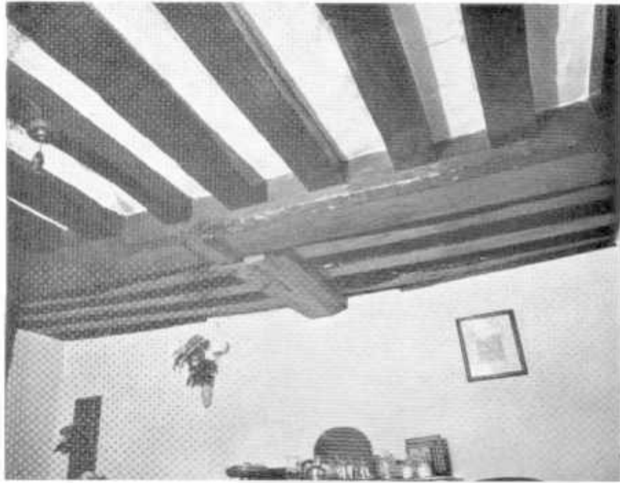
PLATE VI (a).