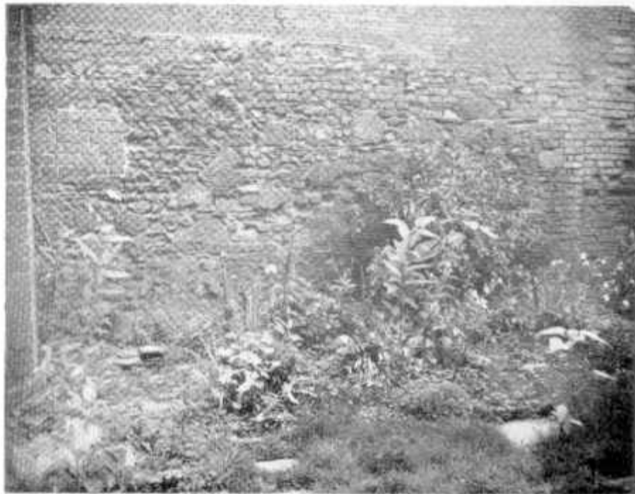
PLATE VI (b).