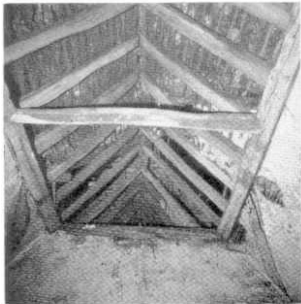
PLATE V (b).