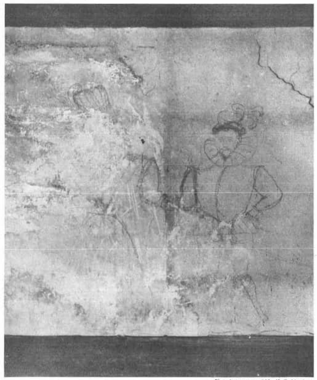
Photo by convexy of Mr. II, G. Muthous PLATE 6. DUNDRIDGE FARM. Wall-drawing on plaster above fireplace