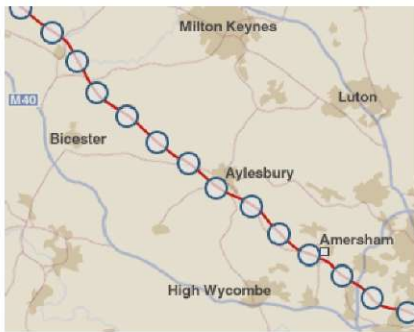
Trace of HS2 through Bucks